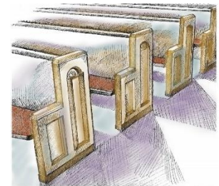
View from the Pews